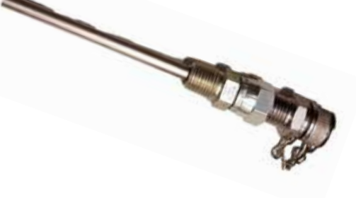
Xamine™ Oil Sample Port

Xtract<sup>™</sup> and Xamine<sup>™</sup> are trademarks of Lubrication Engineers.